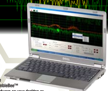
Use BumbleBee™ hardware on your desktop or laptop for spectrum analysis monitoring 24/7.