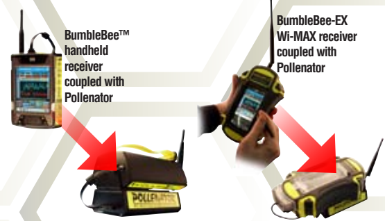
Use your BumbleBee™ receiver and Pollenator™ to interface with your PC via the USB or Ethernet port.

Call us today for more information: TOLL FREE 1-888-737-4287 Tel: +1 732-548-3737 Fax: (732) 548-3404 www.bvsystems.com email: sales@bvsystems.com